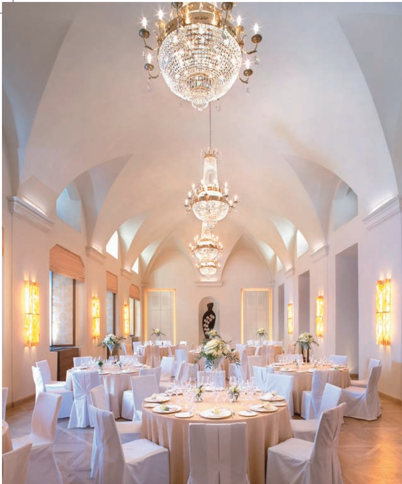
The Grand Ballroom was once a refectory where the monks ate their meals and prayed.

were later joined to form the eastern part of the complex. This is where the restaurant is located, as well as quite a few of the guest rooms facing the river. The most extensive part of the hotel, the Baroque wing which dates to the mid-17th century, includes the Monastery Lounge and both ballrooms, as well as the Presidential Suite.